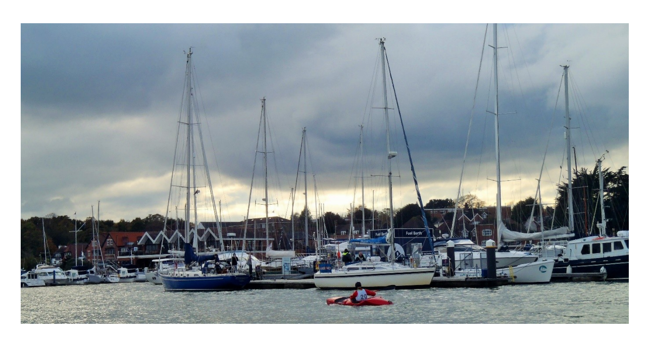
The End is Near

Perfect weather, perfect tide, perfect competition between 34 paddlers in all types of canoes and kayaks with a massive age range of nine to 81.