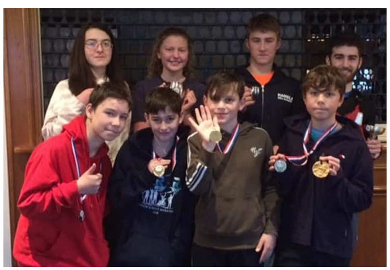
To the Winners the Spoils

The prize giving was held in the RAF Yacht Club and after honing their athletic bodies in competition, the healthy paddlers emptied the Clubs larder with lashings of hot chips and copious quantities of refreshments.