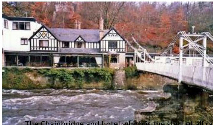
The Chainbridge and hotel which is the start of all races

The sprint course starts at the Chain Bridge hotel and includes the Serpents Tail section of the river where the water narrows into a narrow gorge.